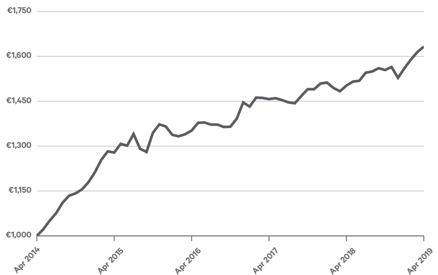
FIGURE 1: Growth of €1,000 to 30th April 2019*