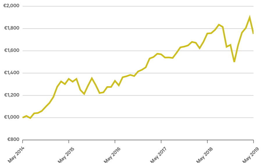
FIGURE 1: Growth of €1,000 to 31st May 2019*