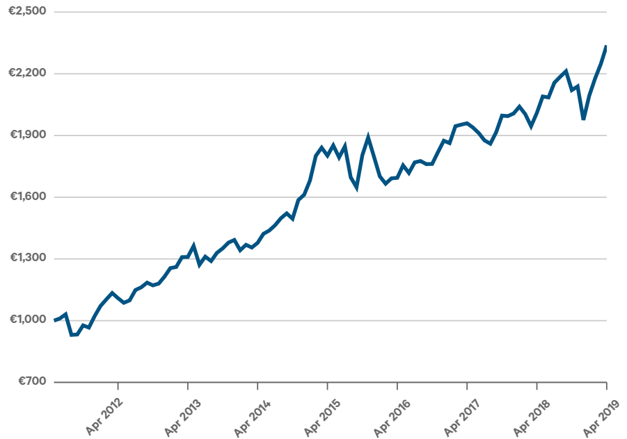
FIGURE 1: Performance for Davy ESG Equity Fund to 30th April 2019

Performance chart refers to Davy ESG Equity Fund A Acc (€) net of fees.