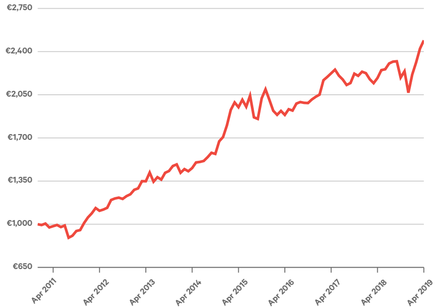
FIGURE 1: Performance for Global Brands Equity Fund to 30th April 2019

Source: Davy Asset Management and Northern Trust. Performance chart refers to Global Brands Equity Fund A Acc (€) net of fees.